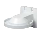
WV-QWL500-W Mount Bracket