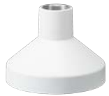
WV-QSR501F-W Mount Bracket