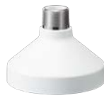
WV-QSR501M-W Mount Bracket