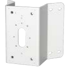
WV-QCN500-W Mount Bracket